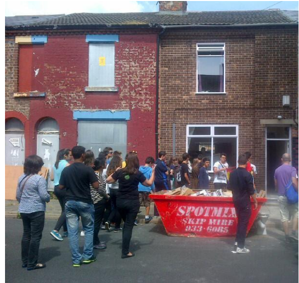
A group of Spanish tourists inspecting Ringo's auntie's house. The coaches of tourists to Madryn Street have taken a keen interest in our redecoration work.

The inquiry is into a planning application from Liverpool Council to demolish over 400 houses and replace them with drastically fewer semi-detached and detached houses with gardens, dropping the density by some 45% percent despite the proximity of the area to the city centre. Only forty houses are to be refurbished.